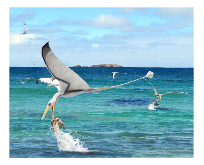
Figure 3. Reconstruction of the hunting behaviour of Rhamphorhynchus muensteri , flying close to the water surface to grab soft-bodied cephalopods such as Plesioteuthis subovata that lived in the uppermost part of the water column. Artwork and background photograph by CK and Beat Scheffold using a model produced by the latter (Zürich).